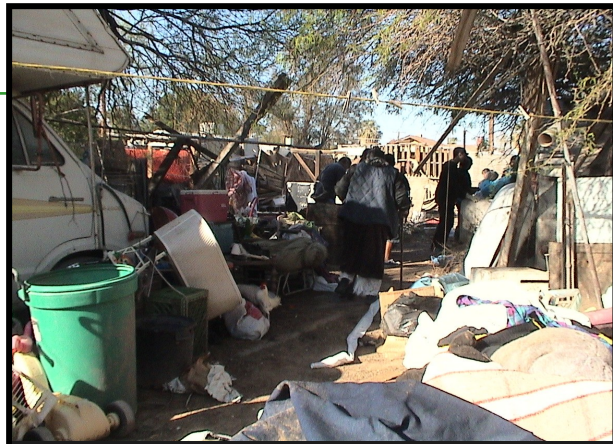
Before the Clean-up.

vice. Also, in an effort to mobilize a proposed Weed & Seed site several lots in Mesa Heights were cleared of dangerous debris. After the event the group met for a cookout of delicious hotdogs with all the trimmings. Lot clean-ups are a good first step to introduce Weed & Seed into the community. As we have witnessed lot clean-ups can also be a sustainability effort even though there is no Weed &