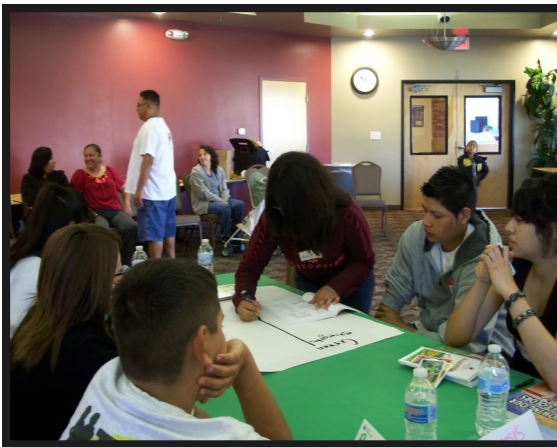
Canyon Corridor youth residents participating in the TILT Youth Program.

importance of community involvement and a sense of pride in their neighborhoods. Our Canyon Corridor first week curriculum was True Colors.